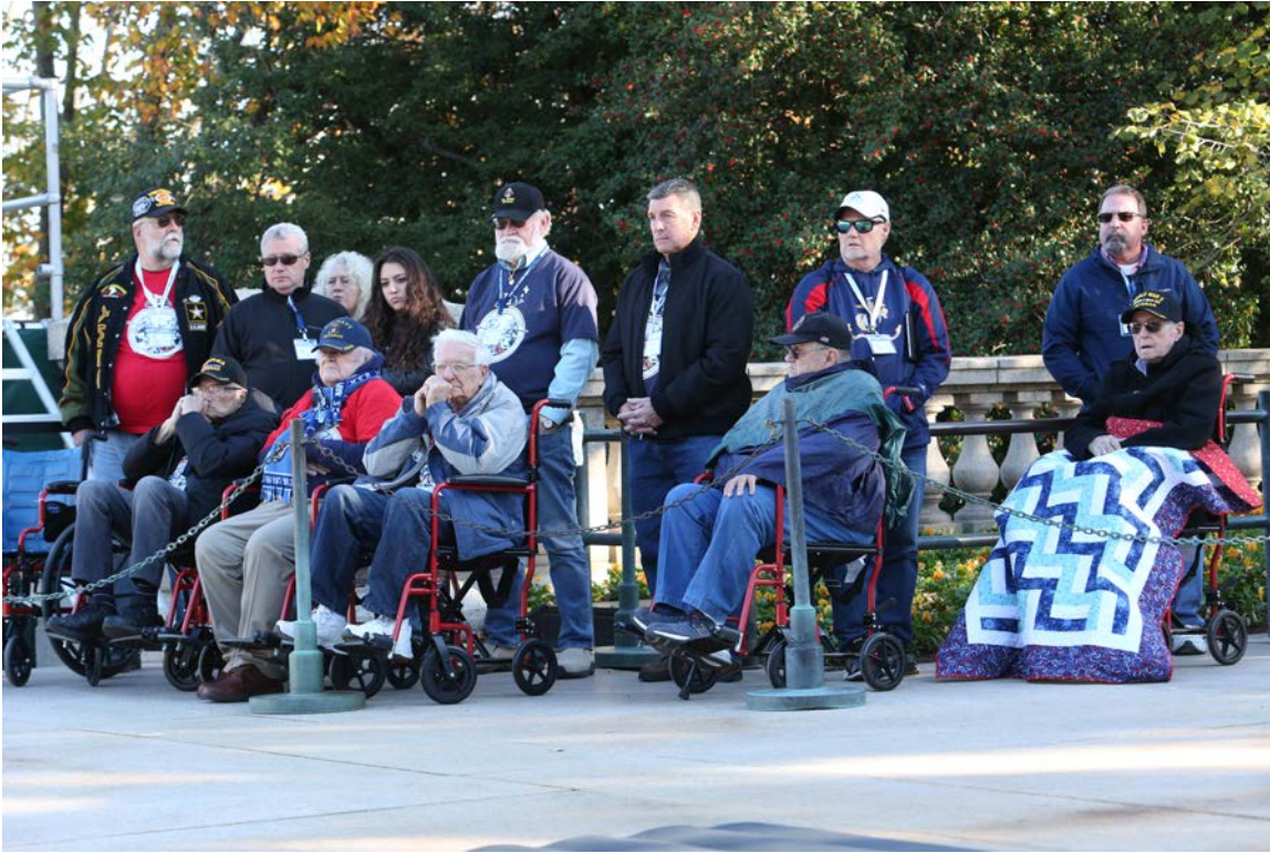
Viewing the changing of the guard at Arlington National Cemetery

An important part of the Honor Flight experience is seeing the Changing of the Guard at the Tomb of the Unknowns, Arlington National Cemetery. This somber ceremony reminds us of those veterans who did not make it home and provides a moment of quiet reflection. If a member of the guard notices that a veteran is present, they may make a scuffing sound with their shoe as a sign of respect.